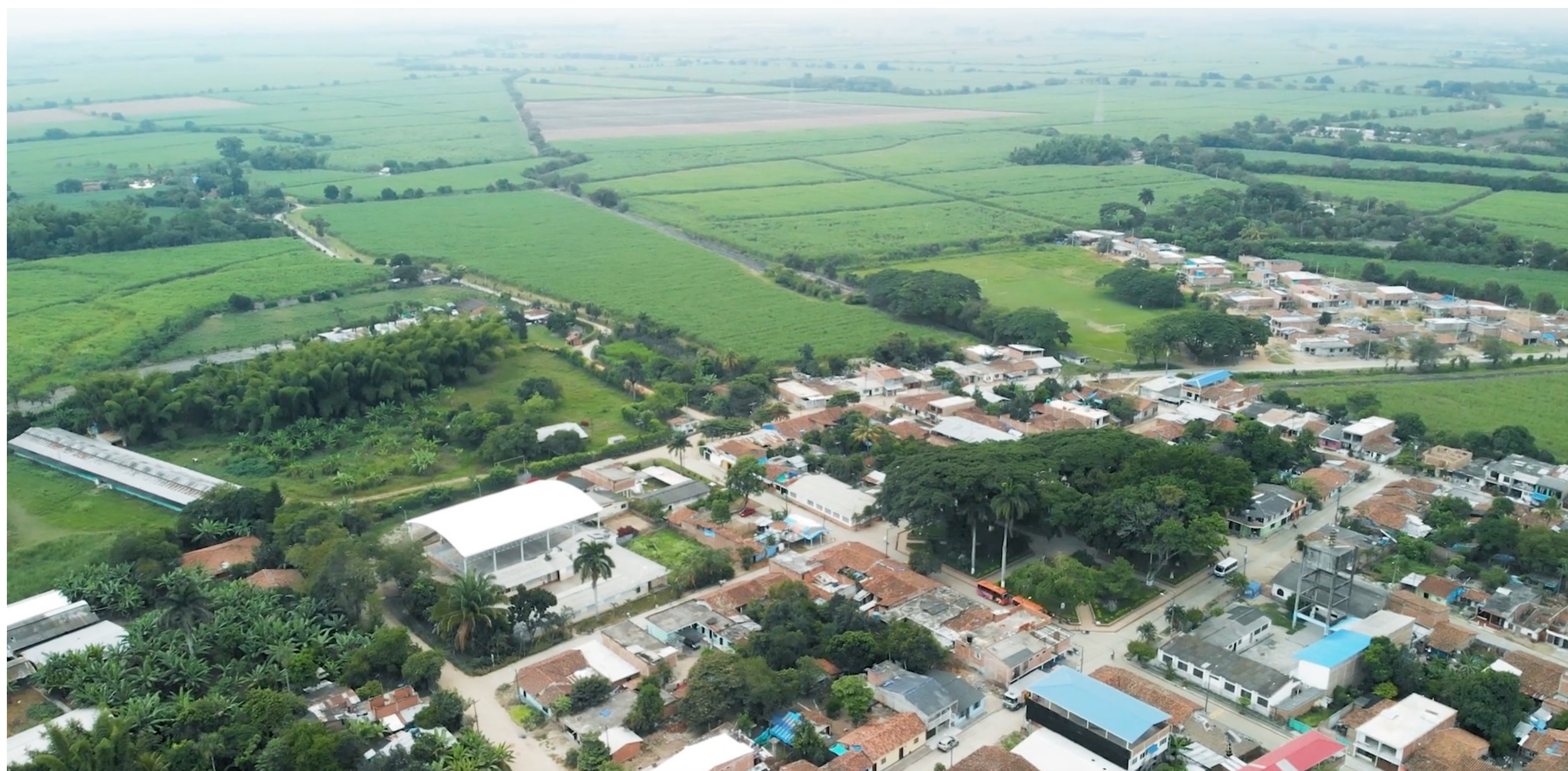
Figure 1. Top view of El Tiple territory surrounding by sugarcane monoculture field. Reference:

El Tiple is one of the underprivileged Afro-Descendant communities enclosed amid a lush desert in the southwest of Colombia. The second-largest monoculture field of sugarcane in the Americas operated surrounding El Tiple territory. Sugarcane monoculture has impacted the community of El Tiple in economic, social and psychological dimensions. The communities have suffered an increasing shortage of water and food, directly proportional to the monoculture expansion. In addition, the use of organophosphates pesticide in sugarcane monocultures has exposed the community to harmful substances and affected the practice of family farming. Finally, the expansion of sugarcane monoculture has confined the community to a small territory with insufficient land for growing food and medicinal plants, which are essential for ancestral cooking practices and maintenance of community traditions.